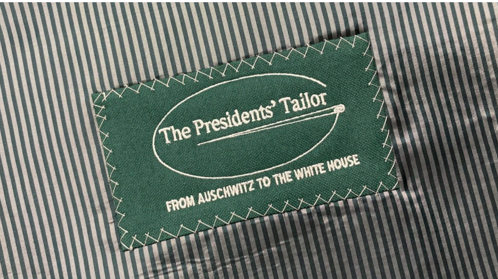
The film's title embroidered onto an iconic Greenfield Clothiers label and sewn onto the traditional jacket lining using the distinctive hand-sewn cross-stitch.