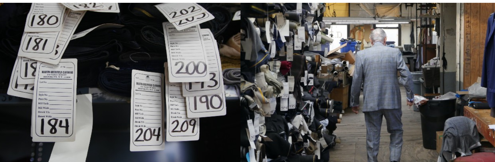
Clothing tags in the storage room at Greenfield Clothiers, Brooklyn, New York